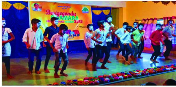
Students of Government Secondary School Meenakalya, Baikampady, Mangaluru, staging a mime act during the summer camp at their school on Sunday.